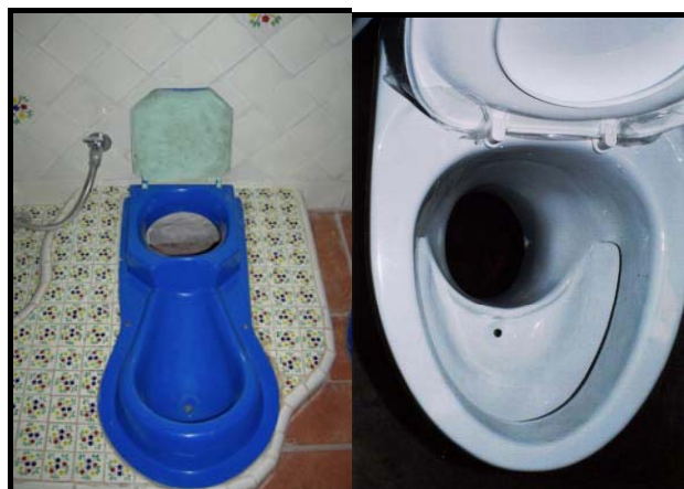
Fig 1: UD Squatting plate

which is used to store and dry the faeces over a specified period. Normally, it is recommended to store faeces for a minimum of 12-months in one vault before emptying. Adding a desiccating material such as ash or sawdust will accelerate the faeces drying process. Typically, in a well-managed ecosan unit, storage times of greater than 3-months will reduce many pathogens to safe levels, in particular those responsible for Ameobiasis, Giardiasis, Hepatitis A, Hookworm, Whipworm, Threadworm, Rotavirus, Cholera, Escherichia coli, and Typhoid amongst others. Ascaris is more persistent though, and may require retention times of 12-months or more.