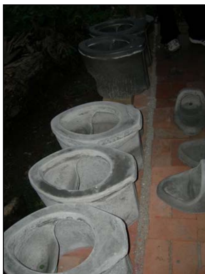
Fig 8: UD Pedestal toilet manufacture in Mexico.

Good quality toilet hardware can be procured/obtained from a number of sources, including a range of producers located in Sweden, Philippines, Mexico, El Salvador and South Africa. Alternatively, products can be manufactured locally, using appropriate mass production techniques including concrete and fibreglass moulds. In the event of local manufacture, considerable care must be given to controlling production quality, and ensuring that the UD toilet hardware is of the highest quality. I.e. concrete toilet pedestals may be covered with a high quality enamel paint or fibreglass layer to produce a smooth, non-porous surface that is easy to clean.