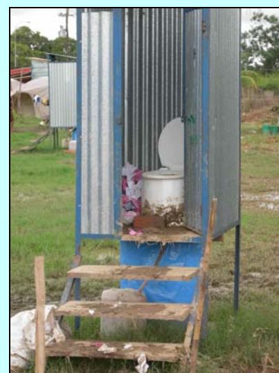
Fig 5: Management problems with used toilet paper

The UD design itself is innovative, as it can be set up quickly, and separates urine from faeces. Urine is drained to a container, while the faeces are collected in a 200-litre drum lined with a bin liner. The local authorities are then responsible for collecting the faeces filled bags on a daily basis. Bags are then disposed of at a landfill after collection by truck. Separating the faeces from the urine facilitates the handling of the two human waste streams. The collection & disposal system does work, but experiences from Bolivia highlighted the local authorities need to provide a reliable O&M service. The awareness of users also needs to be raised, particularly in relation to good hygienic practices.