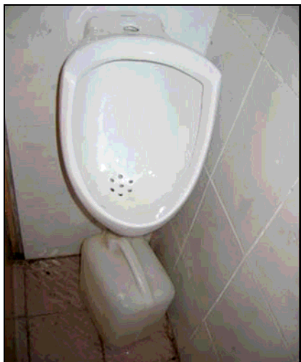
Fig 9: Urinal and container

Choosing hardware that meets the needs and cultural preferences (i.e. seated, squatting, wet or dry anal cleansing) of users is key in terms of technology acceptance.