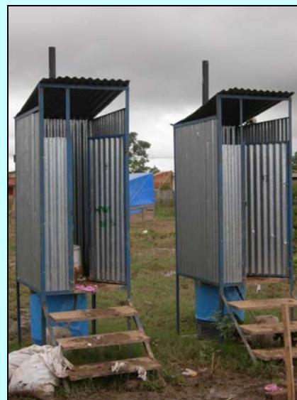
Fig 4: UD Communal Toilet, Bolivia

The units installed on the embankments were set up close to those displaced, and came from a local authority contingency stock (from 2007 floods).