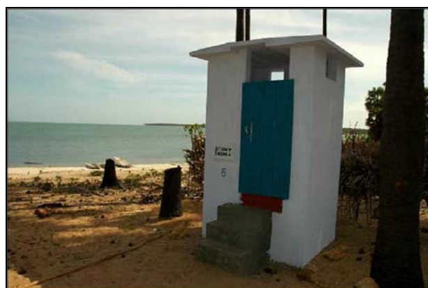
Fig 7: Complete twin vault UD latrine, Sri Lanka