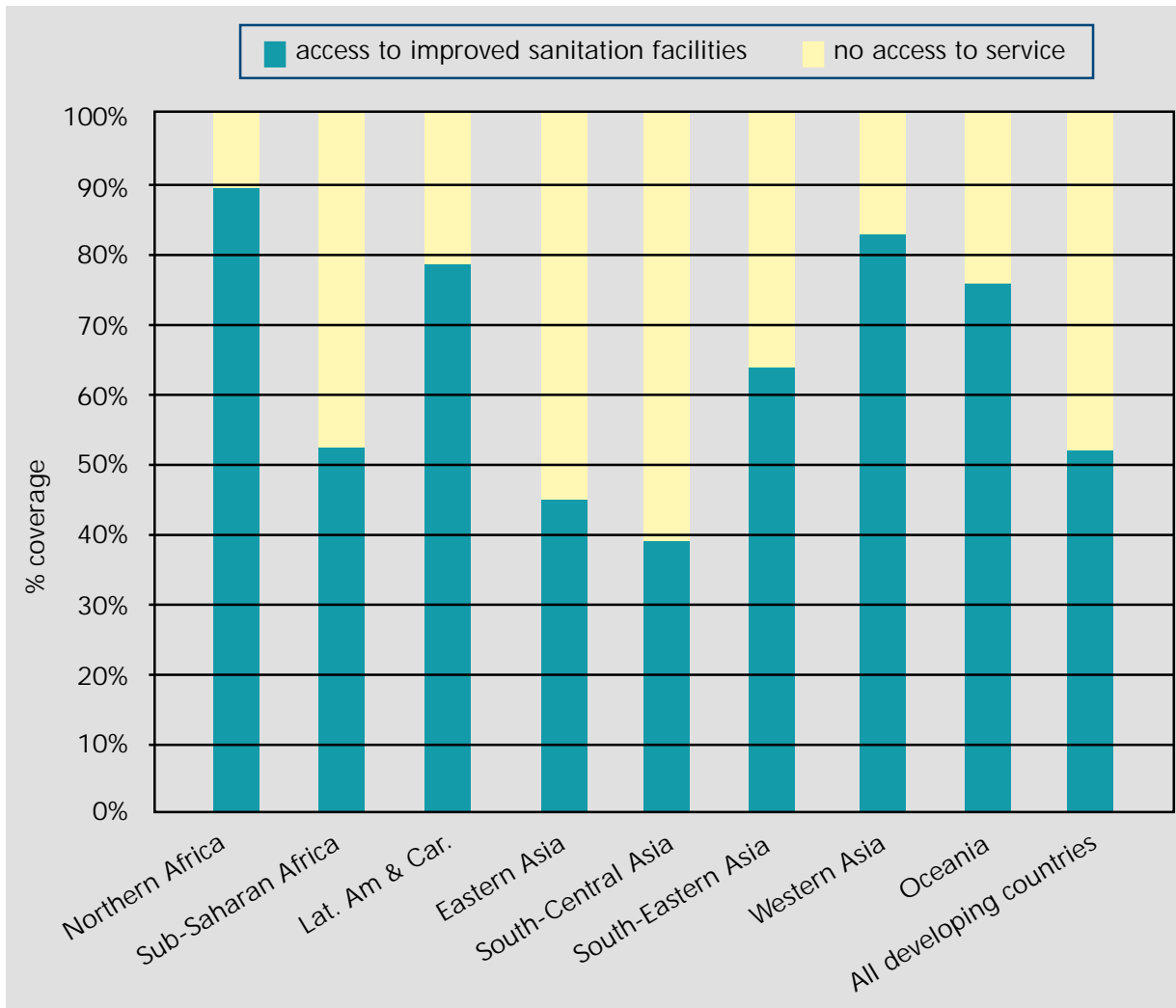
Figure 1. Access to Improved Sanitation by Region in 2000