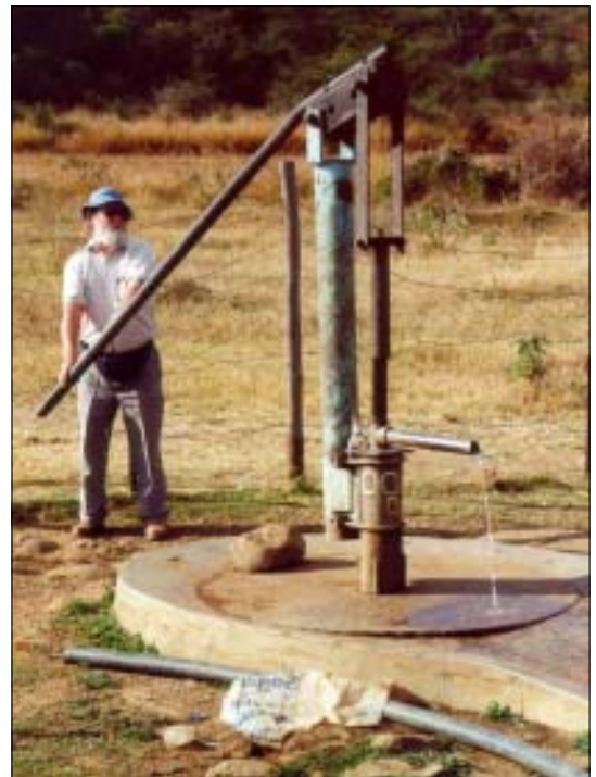
Old DDF long model (A-Type) on dug well