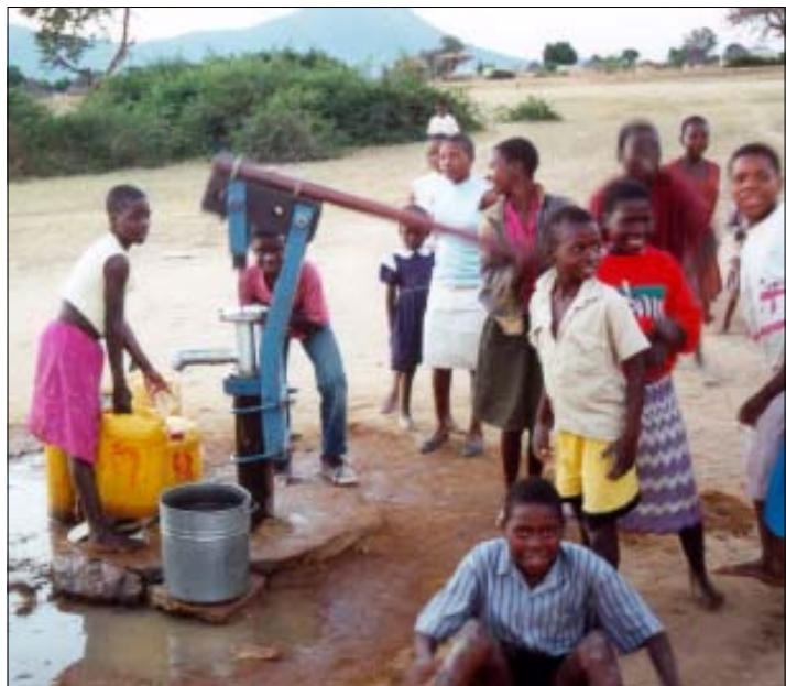
B-Type Bush Pump near school