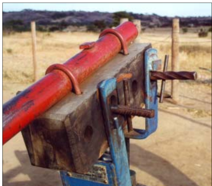
Missing head bolts replaced by reinforcement bars, pump still working

Footvalves on several pumps inspected might be faulty. Many types of footvalves are available in Zimbabwe, but only one type (which is standardised) is known to give a prolonged reliable service. The National Action Committee has recommended the standardised unit for many years, but pumps ordered at district level continue to include footvalves of poor quality.