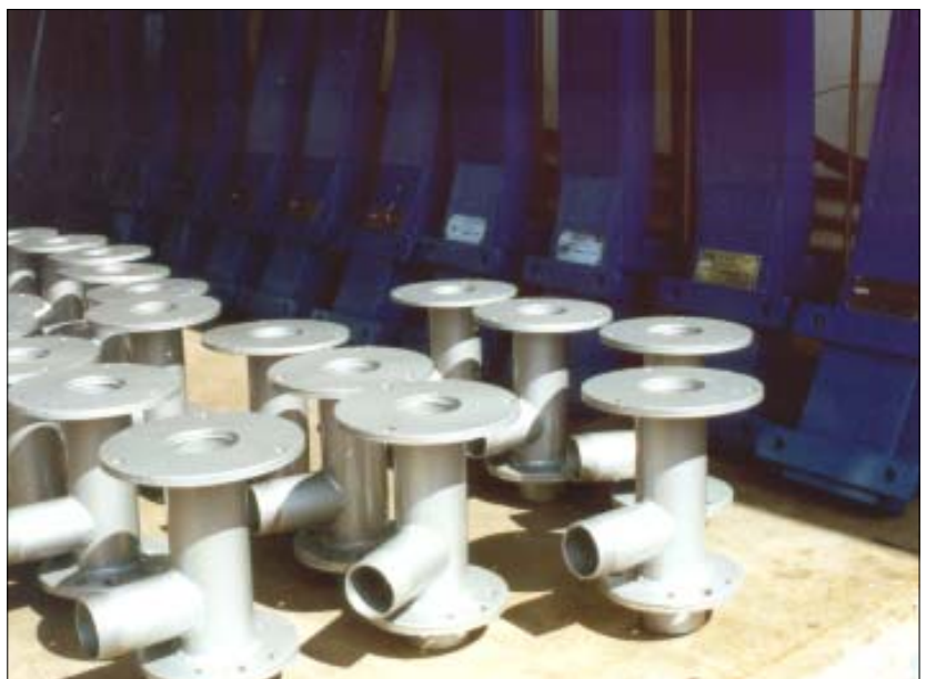
Finished pump components

The total number of Bush Pumps installed in the country is around 3000 per annum.