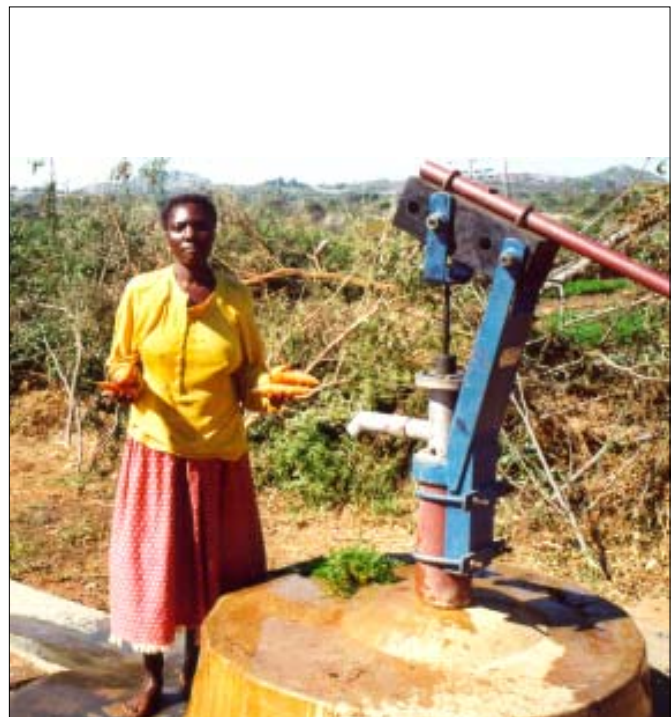
B-Type Bush Pump on dug well

The maintenance is done by DDF with a yearly budget of Z$ 20 million which is approx. US$ 1.1 million (exchange rate 1 : 0.0538 at the end of 1997) This amount is used to service 33'200 pumps including transport, labour and spares. This budget allocation is quite inadequate.