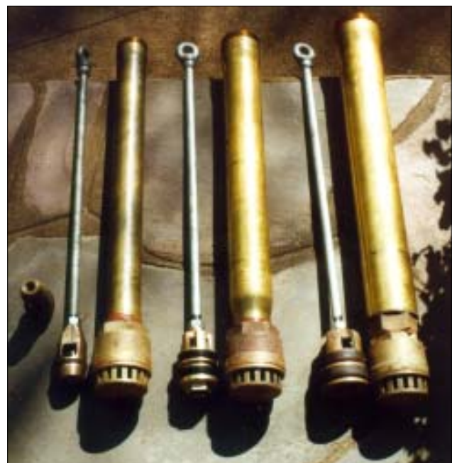
Cylinder variety for extractable B-Type Pumps