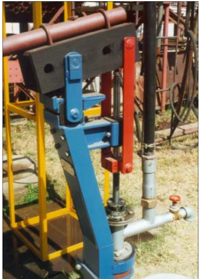
Pressure Type Bush Pump