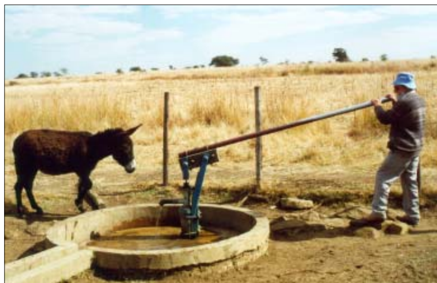
B-Type Bush Pump on borehole

During the transition phase it is essential that the excellent maintenance under the DDF 3 tier system that made the Bush Pump so reliable, can be carried on. Additional funds would need to be allocated to prevent a collapse of the present successful drinking water supply in the rural areas.