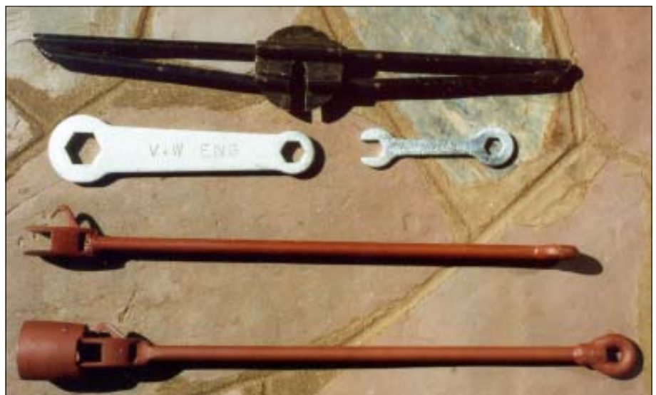
Complete toolkit for Bush Pumps

It is planned to incorporate the Bush Pump into the "International Handpump Specifications" by SKAT-HTN, hopefully at the end of 1998.