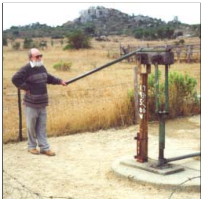
Old Lutheran Bush Pump (A-Type)

After Independence in 1980, the government of Zimbabwe insisted on retaining its own national handpump, but many variations of the pump were built by NGOs and also some government departments. These were used alongside the standard Anderson model.